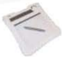
Genee Slate RF