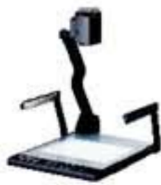
Genee Vision 6100 Visualiser