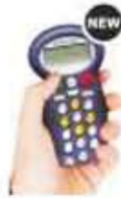
Genee Interactive Response System